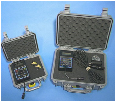
Optional Waterproof Carrying cases for Models 3000 and 2100

SWOFFER INSTRUMENTS 13704 24th St E, #A108 Sumner, WA 98390 USA (253) 661-8706 FAX (253) 661-8711 www.swoffer.com