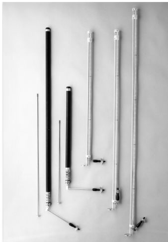
3000-LX, 3000-STDX, 3000-12, -13, -14 wands

PHOTO-FIBER-OPTIC - two-conductor electrical with all electronics permanently encapsulated in epoxy resin.